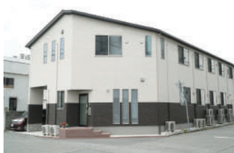
Kurenai-so (students' dormitory )