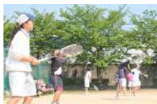
Soft tennis club