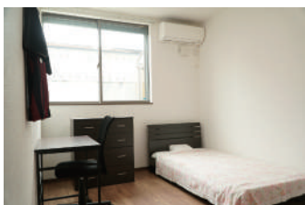
Keiai-kan ( a dormitory for exchange students )

Conveniently located walking distance to the school, fully furnished dormitory rooms are available for our international students. Nutritious meals are provided three times a day, by our resident staff.