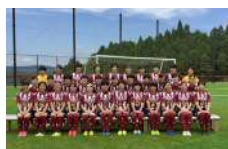
☆ Soccer club