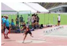
☆ Track-and-field sports club