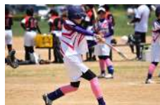
☆ Softball club