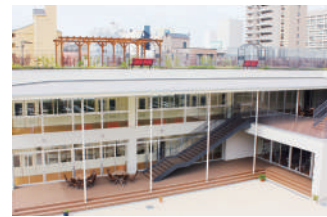
South Building for junior high school