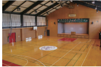
Auditorium (gymnasium )