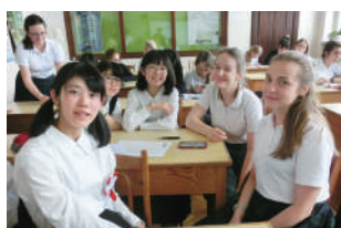
Nazareth High School