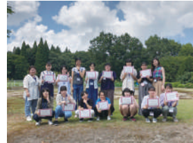
Liberal Arts Summer camp

Arrival of Nazareth High School of the Republic of Poland / Cultural Festival