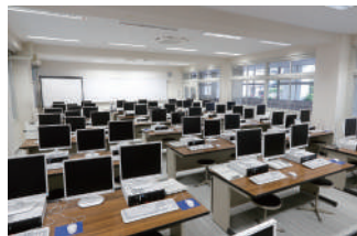
Information-processing and Computer Room