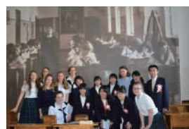
Study trip to the Republic of Poland

Guidance for securing employment (3rd graders)