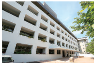
North Building for high school