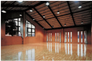
Hakurin-kan ( for table tennis / dance studio )