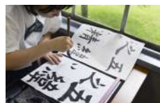
Calligraphy & pen club