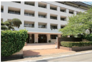
The main gate