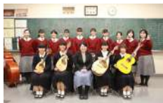
☆ Guitar/Mandarin club