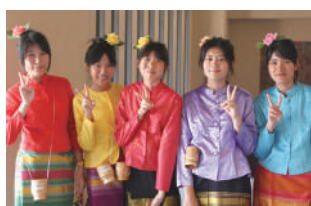
Khema Siri Memorial High School

Founded in 2001, this school was established by a former Paraguayan Ambassador to Japan. This school offers education to students beginning from kindergarten to high school. At present, there are about 350 students who have origins from Japan.