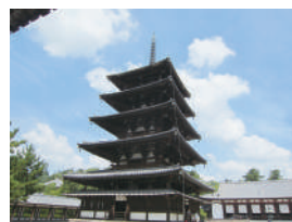
Seminar trip to World Heritage site

School trip (2nd graders) / Bus trip (1st and 3rd graders)