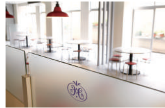
A dining hall