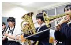
Brass band club