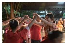
Study trip to the Republic of Indonesia

Students' counselors' election / Study trip to the Republic of Indonesia (interested students, every other year) / Study trip to Thailand (interested students, every other year) / Lecture meeting for college oriented