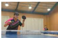
Table tennis club