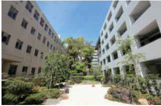
Kengaku-no-niwa (garden of the school's establishment)