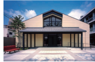
Yuho-kan ( for martial arts)