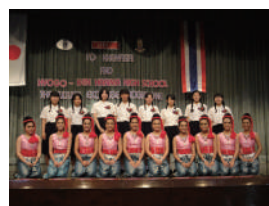
Study trip to Thailand

Seminar trip to World Heritage site (1st and 2nd graders) Liberal Arts Summer camp (1st graders)