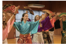
Arrival of Nazareth High School of the Republic of Poland

Music Festival / Authorization of manners