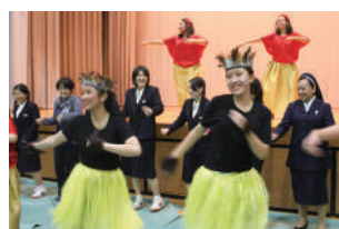
Tarakanita the First High School