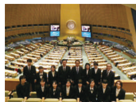
New York SDGs Seminar Trip

Graduation Ceremony / Language Seminar by Portland State University in U.S.A. (for those interested )