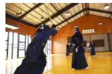
☆ Kendo (Japanese fencing) club