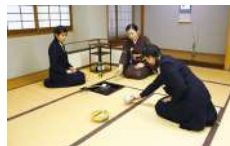
Tea ceremony club