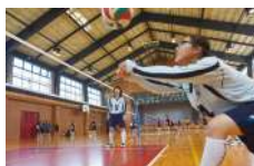
☆ Volleyball club